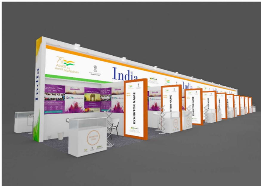
Model 1 : Carpet