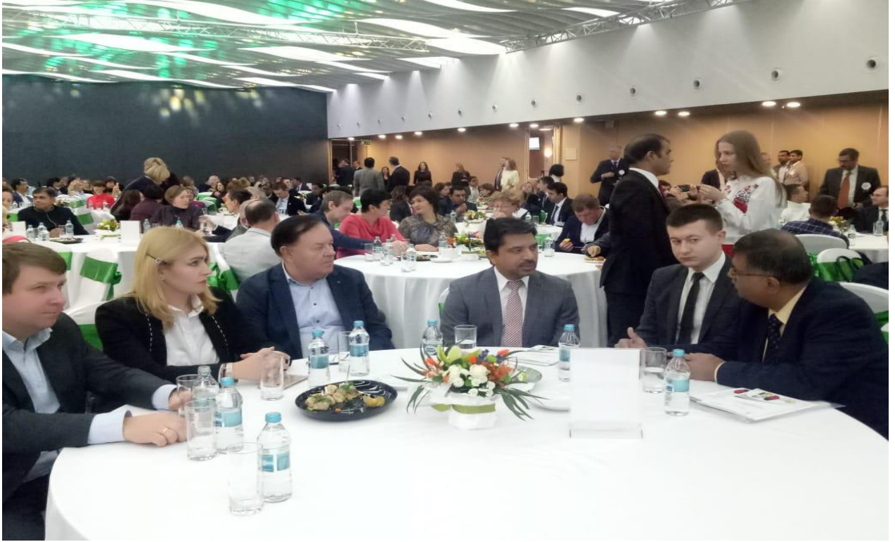
BSM at Hotel Ramada Encore Kiev on 29th November 2018