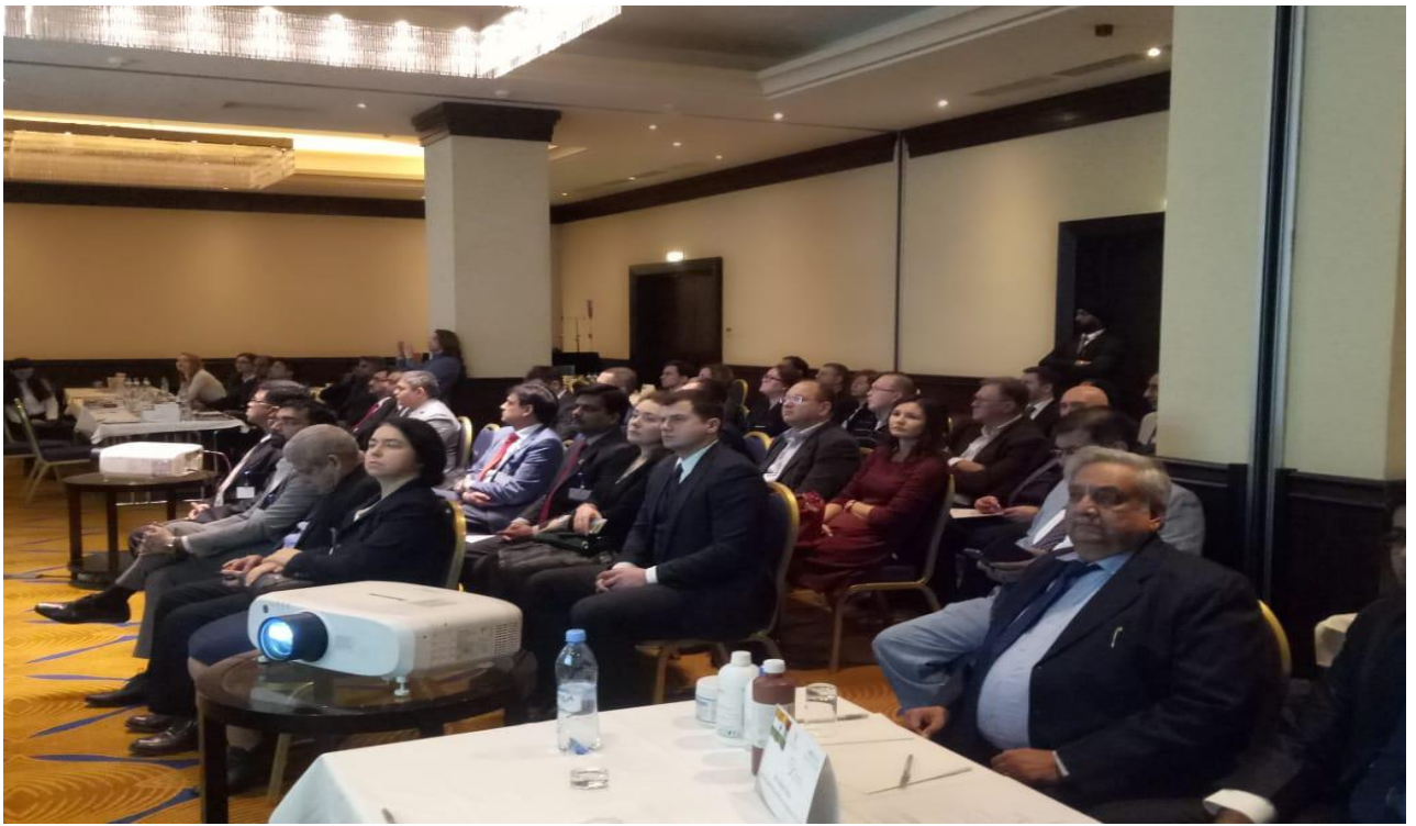
Inauguration of India - Russia Pharma Business forum at Moscow Russia during 22nd November 2018.