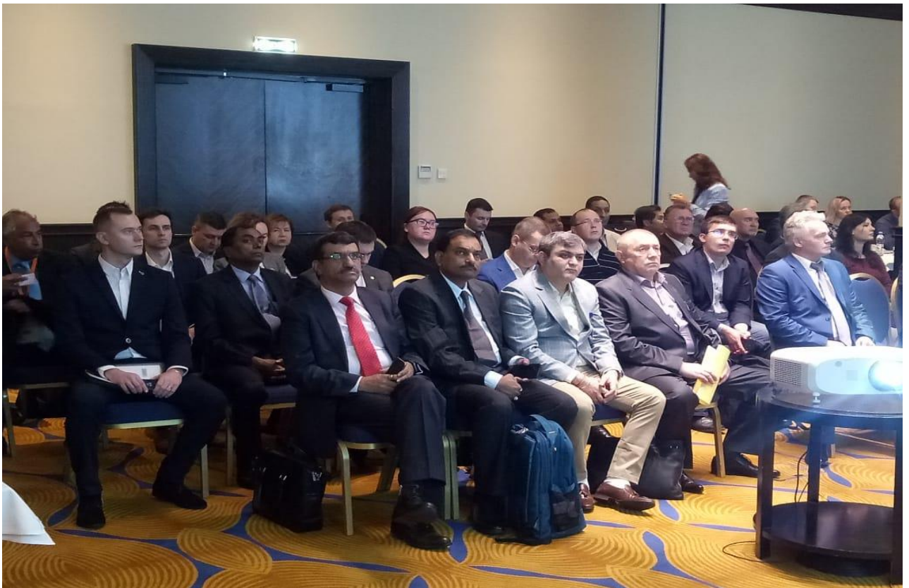
Inauguration of India - Russia Pharma Business forum at Moscow Russia during 22nd November 2018 at Hotel Renaissance Moscow Monarch Centre, Moscow, Russia.