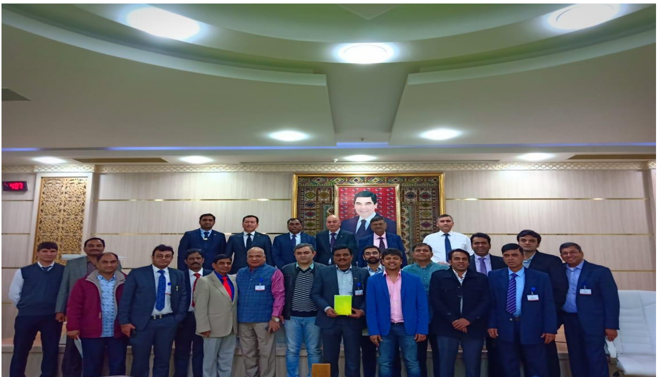
Group Photo of Indian Delegates during BSM on 27th November 2018 at Hotel Yydlyz, Ashgabat, Turkmenistan