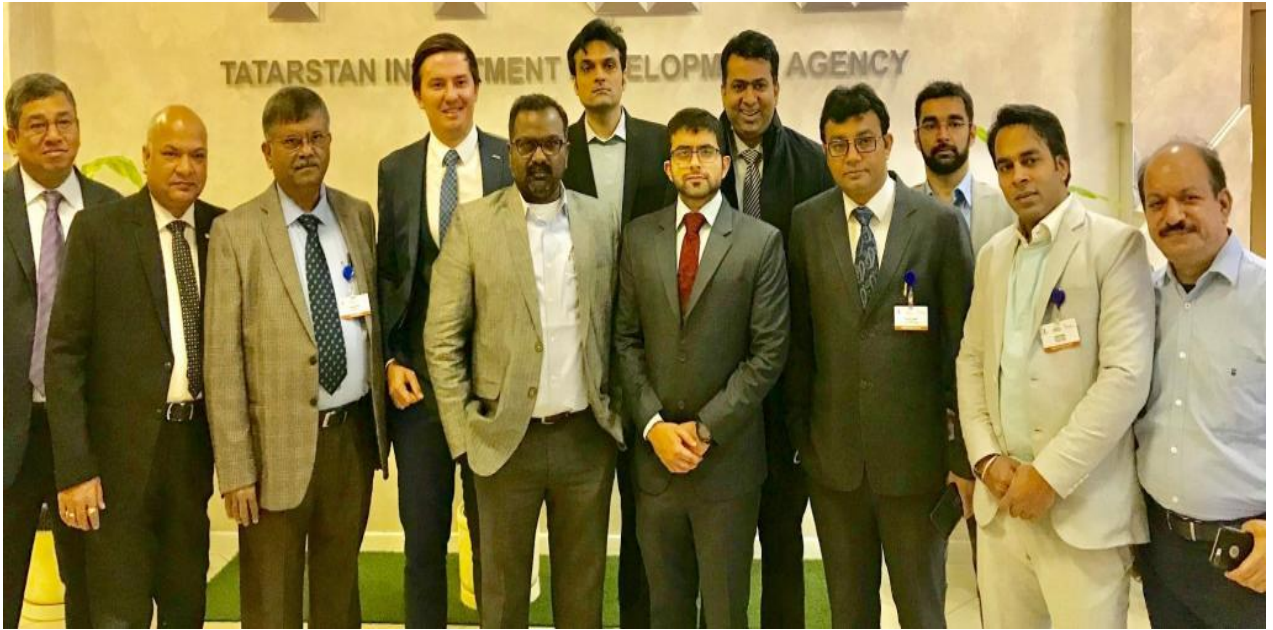
Group photo of Indian delegates along with Senior Officers of Pharmexcil and Embassy of India, Moscow at Tatarstan Investment and Development Agency