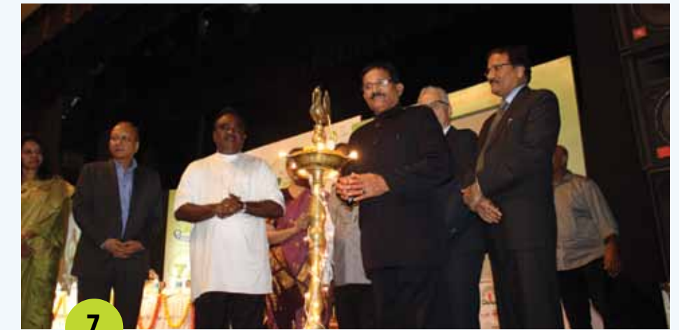
7 th Ayurveda Congress, 2016- Kolkata Theme: 'Strengthening the Ayurveda Eco Systems'