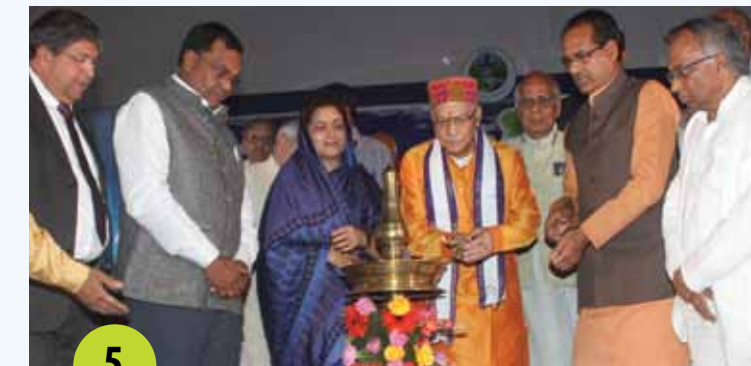
5 th Ayurveda Congress, 2012 - Bhopal Theme: 'Enriching Public Health Through Ayurveda'