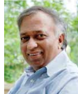
Dr. Vijay P Bhatkar President Vijnana Bharati

Every two years, the admirers, practioners, entrepreneurs, teachers and students of Ayurveda assemble around the month of December to participate in the World Ayurveda Congress (WAC) in the country. The representation is not just from different parts of India, but also from all over the world. The atmosphere has always been that of a festival 'Celebrating Ayurveda'.