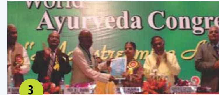
3 rd Ayurveda Congress & Arogya Expo, 2008 - Jaipur Theme: 'Mainstreaming Ayurveda'