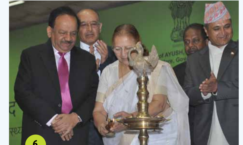
6 th World Ayurveda Congress & Arogya Expo 2014, Delhi Theme: 'Health Challenges and Ayurveda'