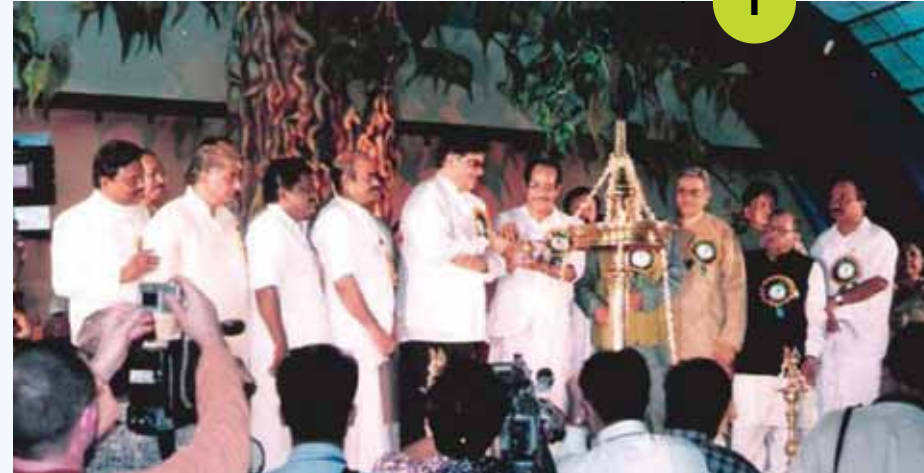
1 st Ayurveda Congress, 2002 - Kochi Theme: 'Ayurveda & World Health'