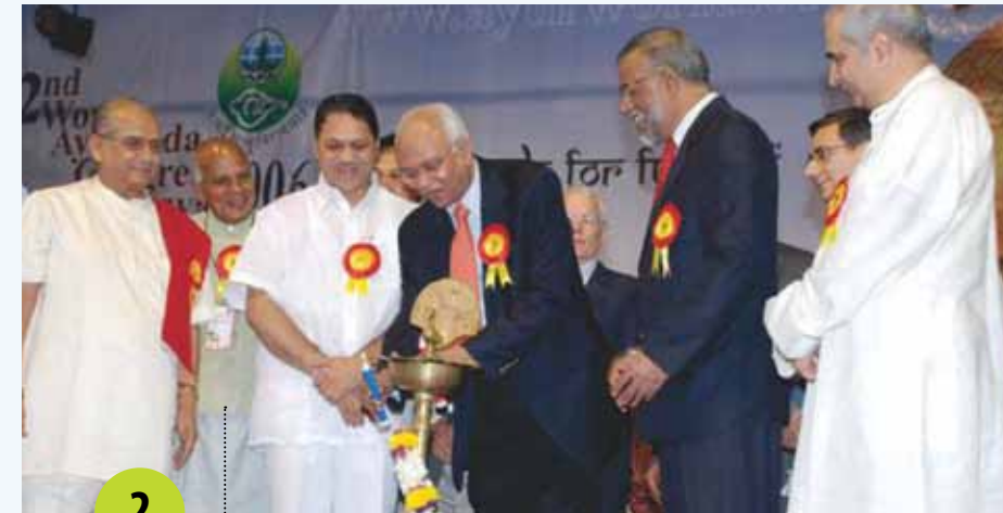
2 nd Ayurveda Congress & Arogya Expo, 2006 - Pune Theme: 'Globalisation of Ayurveda'