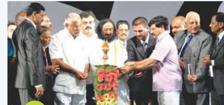
4 th Ayurveda Congress & Arogya Expo, 2010 - Bengaluru Theme: 'Ayurveda for all'