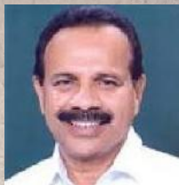
Shri D V Sadananda Gowda Hon. Minister for Chemicals & Fertilizers, GoI